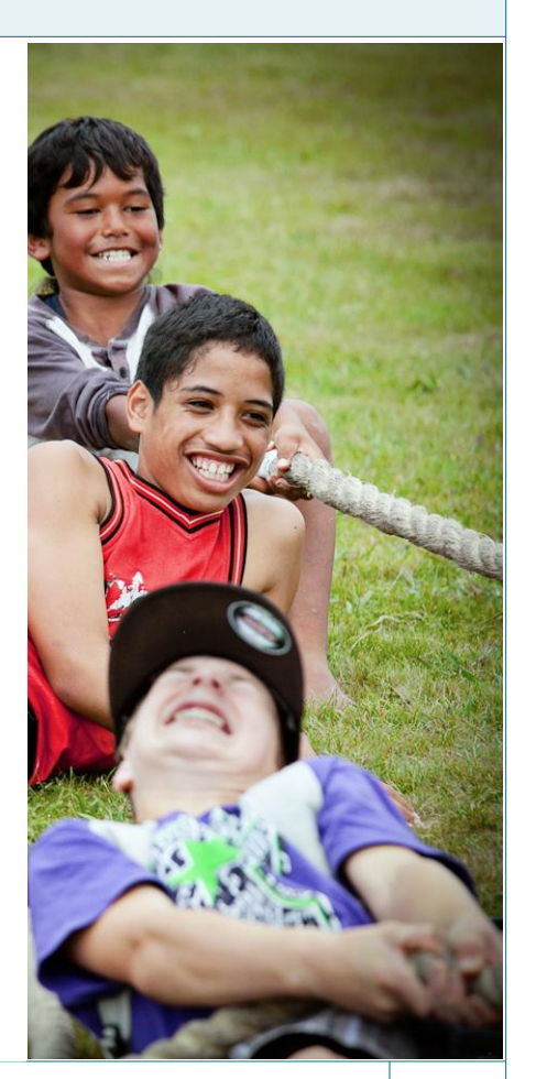
Working differently for young people